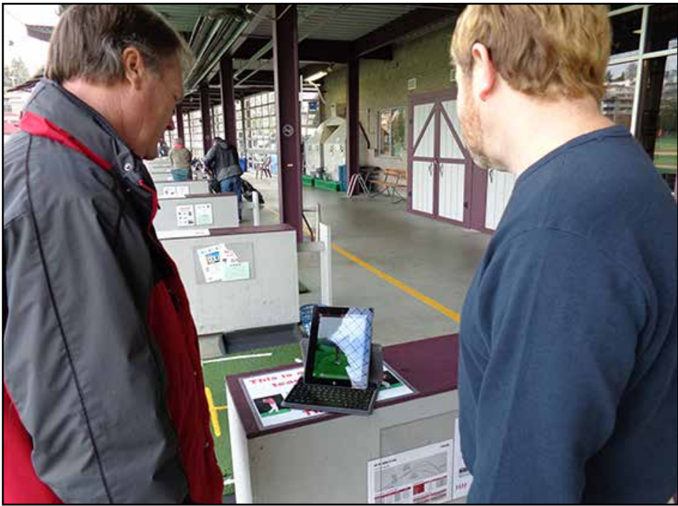
Two Interbay golf instructors looking over a new piece of equipment used to enhance the teaching experience.