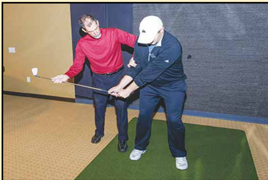
Golf professionals are dedicated to improving your game with hands-on instruction.

Save this Special Section if you plan on taking lessons this year