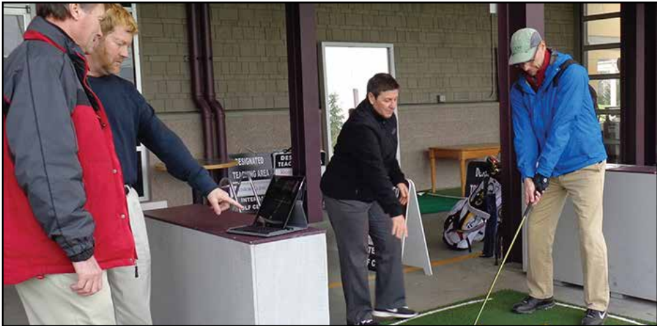
Premier instructors at Interbay use the latest technology to analyze a student's swing performance.