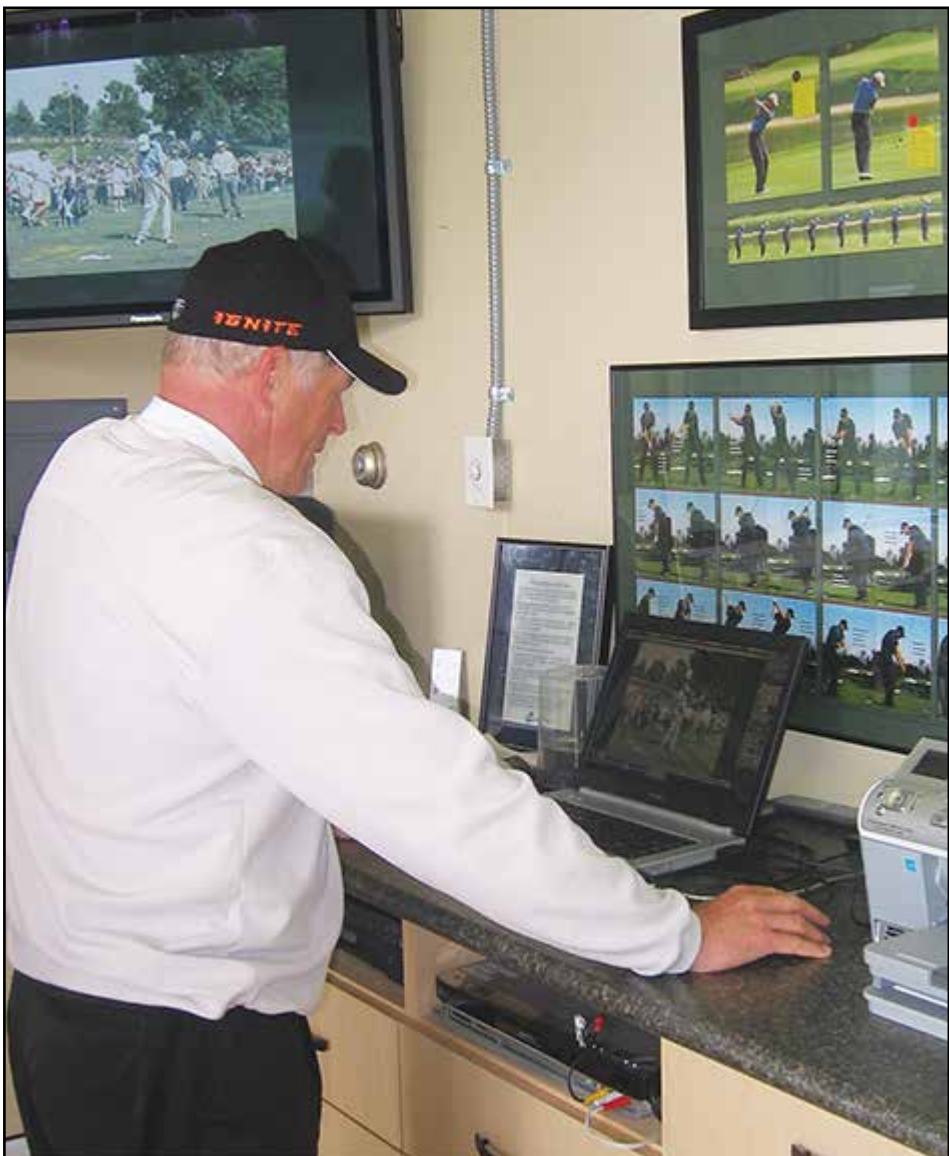
High-tech equipment makes learning easier and has changed the way instructors teach students today.